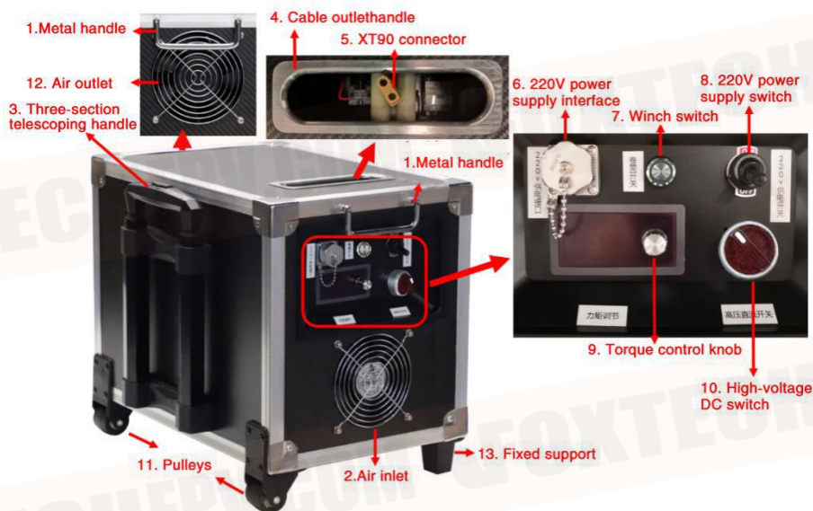
Figure 1 Appearance of FOXTECH T4000 Tethered Power System

The basic functions of the product are tethered cable storage, automatically cable collection, automatically release and automatically arrange the cable. It is integrated with high-power ground power module, which can convert current (AC) to high-voltage direct current (DC). The high precision and power servo motor is integrated in T4000. The torque of the motor can be adjusted flexibly. It is light in weight and small in size, which can be carried and operated by a single person and can be quickly integrated into other platforms such as vehicles and ships.