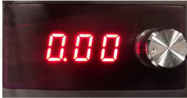
Figure 3 Torque adjusting knob and its screen

flight attitude, but also improve the efficiency of automatic taking-up and releasing.