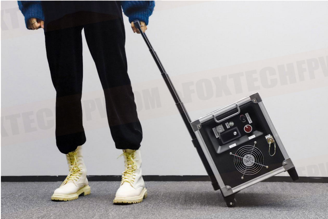
Figure 2 T4000 tethered power system for easy carrying

The dimension of the FOXTECH T4000 tethered power system is 430mm(L)*290mm (W)*330mm(H) and the weight is 20kg. The bottom of the box is equipped with pulleys and fixed support. The side of the box is equipped with three-section handle, the stretching range of the rod to the ground is 510mm to 800mm, which will suit for the needs of people of different heights. In addition, both sides of the box are equipped with aluminum handles, which can be handled directly when needed.