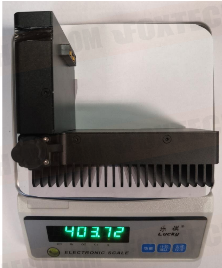
Figure 2- 1 Weight of Onboard Voltage Converter(M300 Version)